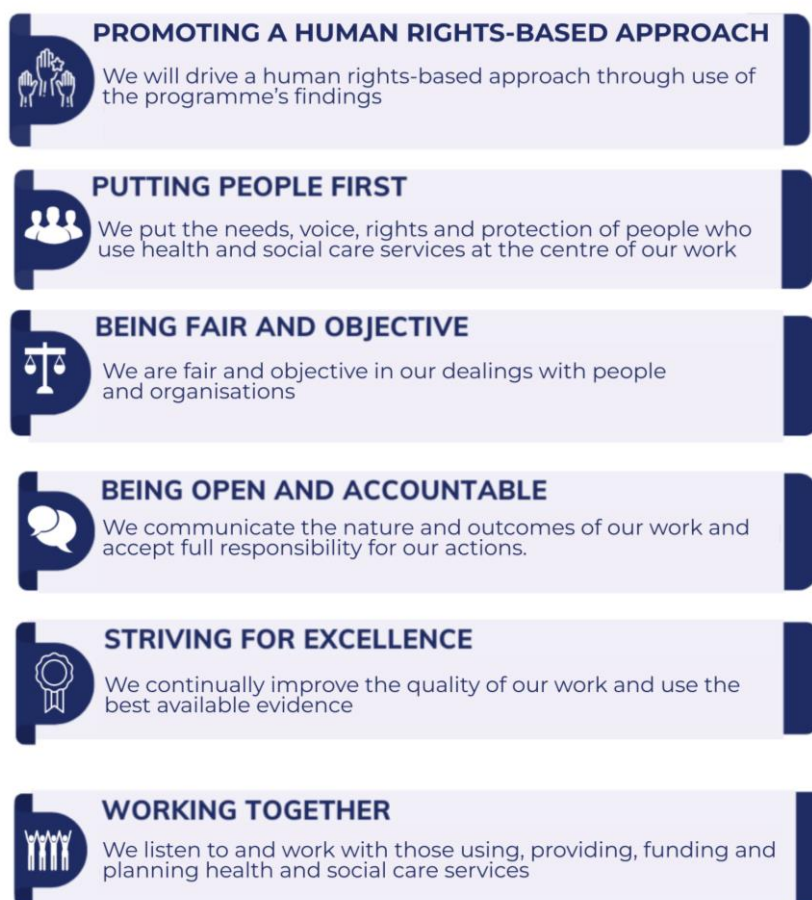
Figure 2: Values of the National Care experience Programme

This strategy is underpinned by those values, as set out in figure 2.